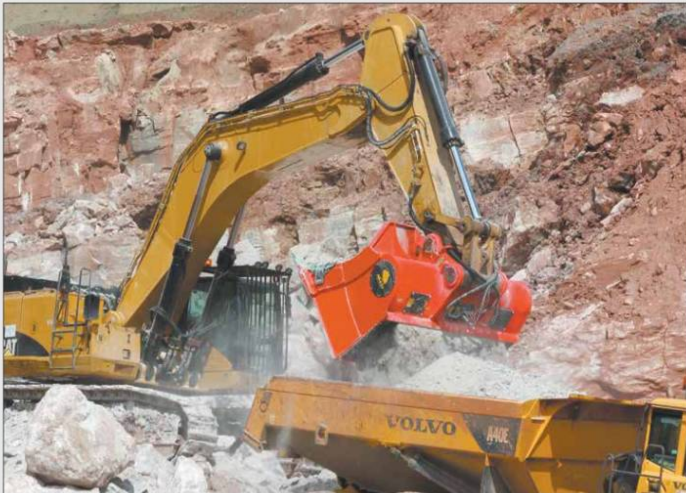
ALLU Transformers ensure high production with lower operating costs by converting base machines into a mobile processing plant.

RDW has appointed a dedicated Australian ALLU dealer network that has