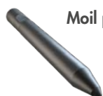
Moil point tool